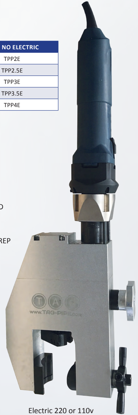
Electric 220 or 110v